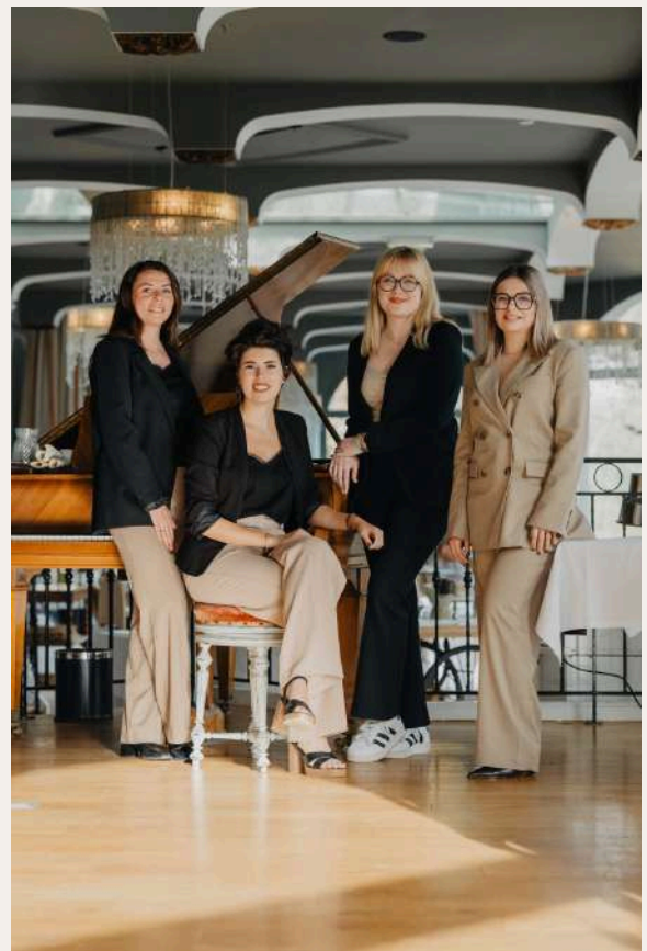
Photos are subject to copyright and image rights. Any reproduction is prohibited.